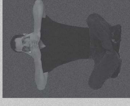
PERCEPTION OF ART